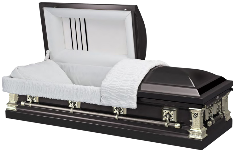
Duskwing ( Cremation NA )