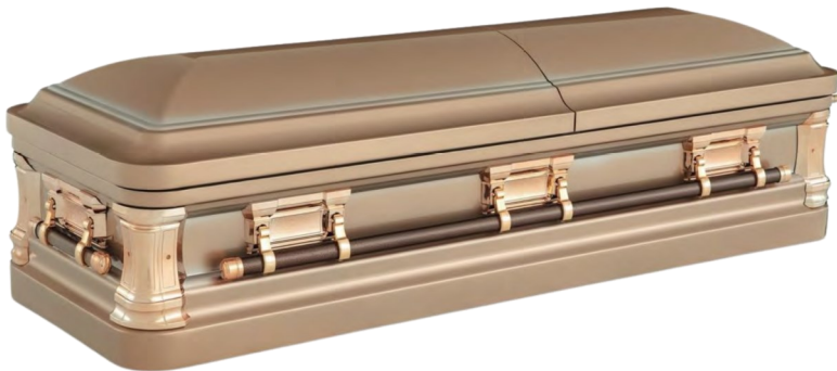
Empress ( Cremation NA )